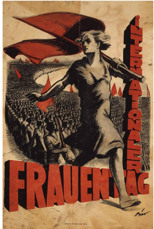
International Women's Day, 1932